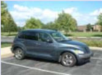
Steel Blue Pearl 2002 Chrysler PT Cruiser, 4-speed Automatic, low mileage, 4-wheel Disc brakes, anti-lock ABS, 16" Aluminum wheels, Leather seats, & heated front seat.

The credit union reserves the right to reject any and all bids that are submitted. In the case of tie bids, the affected submitters will be allowed to re-bid. For additional information or to receive Bid Forms or to inspect the vehicle please contact the main office at 419-534-3770.